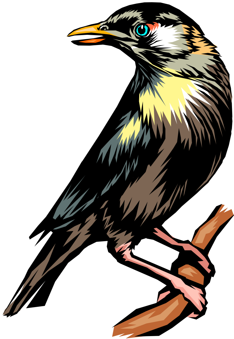
cú:jò kho-doe bird